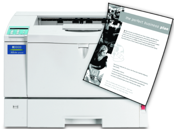
Sample Print outputs one complete set for review before producing multiple sets, reducing waste and time.