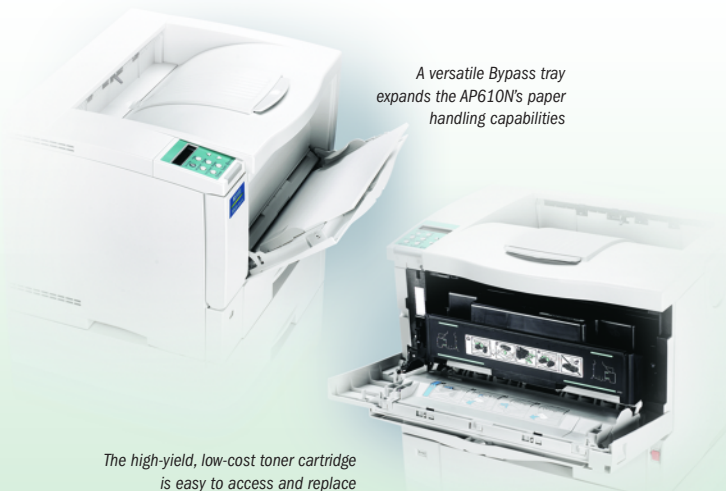
A versatile Bypass tray expands the AP610N's paper handling capabilities

A standard 500-sheet paper supply holds a full ream of letter-size paper and offers a versatile 100-sheet bypass (standard). Print onto plain paper, up to 11" x 17", and a wide range of media types, including transparencies, card stocks, recycled papers and custom paper sizes. Print envelopes with ease — up to 10 via the bypass or 60, via the optional Envelope Cassette. The optional Duplex Unit cuts paper usage, saving money and filing space. Add one or two 500-sheet paper feed trays to take your total paper capacity to 1,600 sheets , minimizing work interruptions.