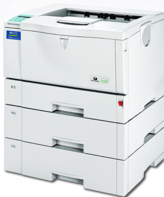
Fully configured Ricoh Aficio AP610N

When time is money, this workhorse printer won't disappoint. The AP610N's large expandable paper supply, easy maintenance, intuitive management utilities, and wide variety of connectivity options, including wireless, enable you to achieve maximum office productivity. Setting a new standard in workgroup printers, the affordable AP610N's seamless network integration, high reliability, and cost-efficiency make it an exceptional value...one uniquely engineered to boost your bottom line.