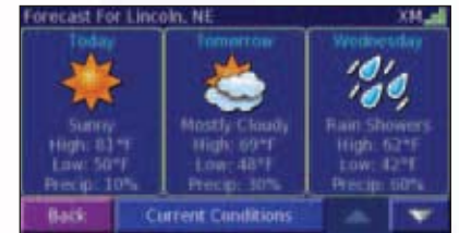
Optional XM WX™ Satellite Weather service helps you steer clear of hazardous conditions

Interfaces: USB 2.0 full speed device Antenna: Built-in patch; MCX-type connector for optional external GPS antenna connection