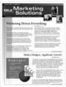
Output as 2 single sheets

The Brother MFC-8860DN provides all the features, convenience, versatility and performance of the MFC-8460N and adds built-in automatic duplex (two-sided) printing, copying, scanning* and faxing. This feature can help you cut paper costs by as much as half, while giving you the ability to create professional two-sided documents for reports, proposals and other tasks, quickly and easily.