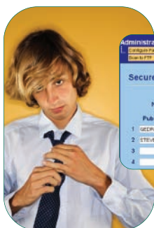
Intern Clearance: Copy only