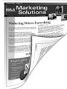
One double-sided (duplexed) sheet