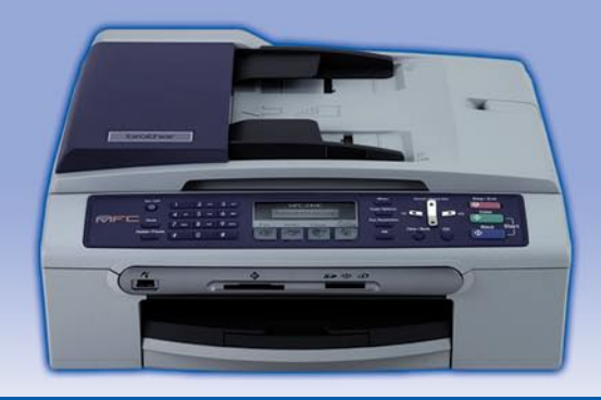
MFC-240c Color Inkjet Flatbed All-in-One

For the latest driver updates, access the Brother Solutions Center at http://solutions.brother.com