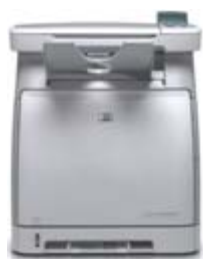
HP Color LaserJet CM1015 MFP