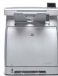
HP Color LaserJet CM1017 MFP

All of the features of the HP Color LaserJet CM1015, plus: