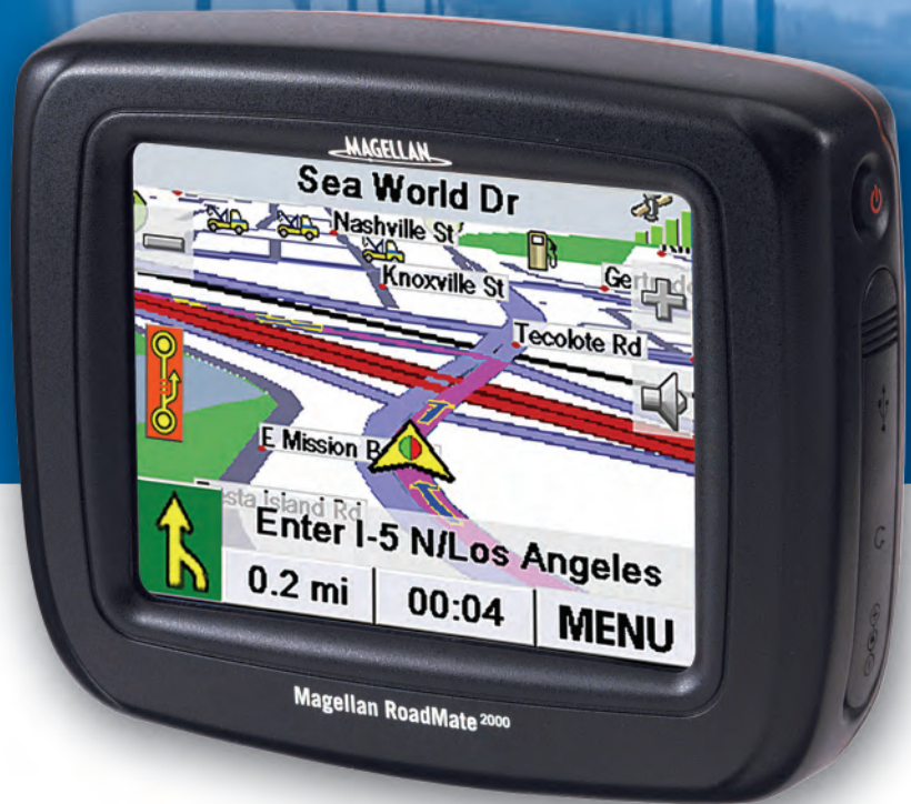
Product shown at actual size.