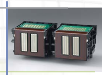
Dual Print-Head System

The iPF5000 features Canon's newly developed 12-color pigment ink system with LUCIA ink that produces a wide color gamut to expand the range of color reproduction. The expansive color space produces brilliant color that accurately matches the image captured with fine precise detail. The two levels of gray provide a crisp monotone output that surpasses expectations. Also, the utilization of automatic switching between regular black and matte black eliminates the wasted ink and time spent swapping out ink tanks.